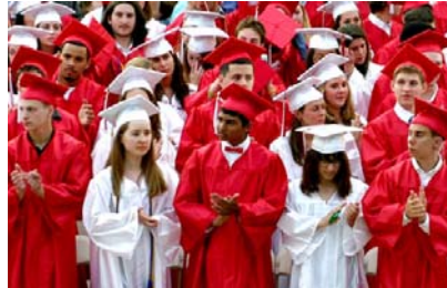
Sales of 2007 Lower Merion and Harriton High School graduation DVDs raised funds for the Education Foundation of Lower Merion.