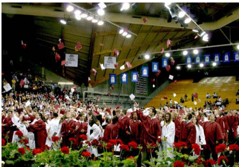
The 2007 Lower Merion High School graduates celebrate their achievement. The EFLM wants to ensure that graduating classes 20 years from now will receive the same high-quality education that this year's class did.

Historically, Lower Merion School District has been able to support a range of programs that have kept its six elementary schools, two middle schools, and two high schools at the forefront of public education. In 2006, however, Pennsylvania legislators enacted property tax legislation that sets a limit, tied to inflation, on how much school budgets can increase each year, which will potentially constrict the district's ability to maintain its range of offerings for students while implementing new and innovative programs.